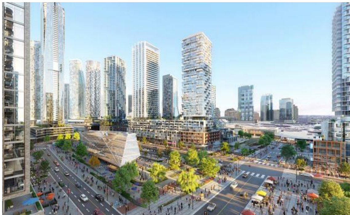
Rendering of Square One District southwest view.

Developing the entire downtown with 37 new towers is expected to take at least three decades.