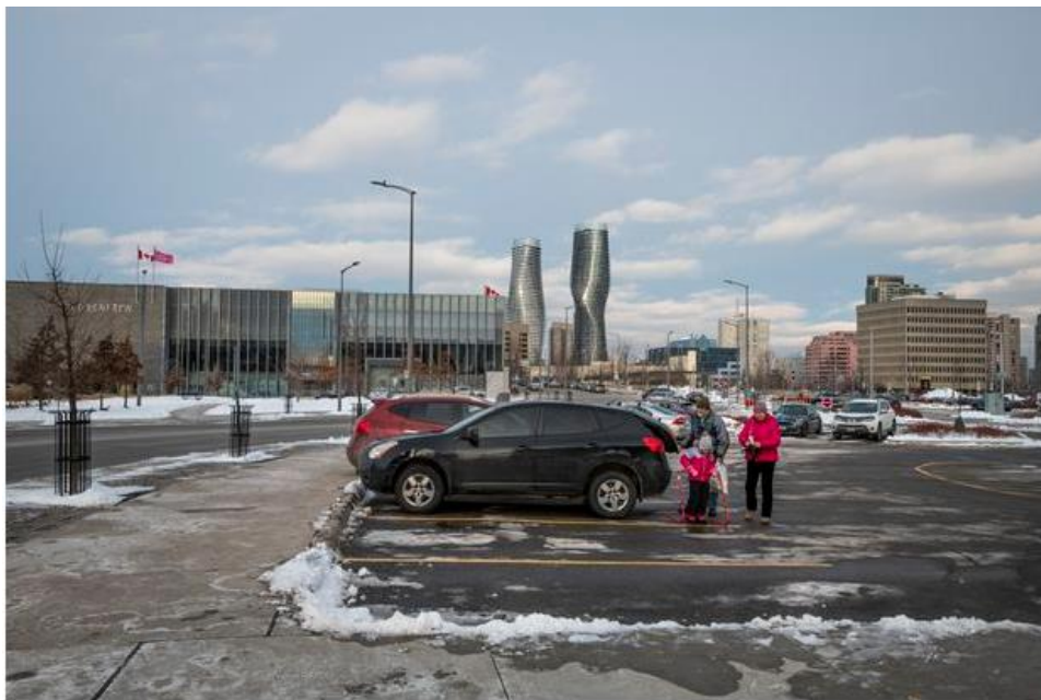
The Square One Mall where a proposed new 37 building development project will emerge in Mississauga on January 21, 2020.

The lack of housing in the Toronto region has driven up real estate prices and rental rates to levels that are well out of reach of many residents. Local governments have been pushing for denser living arrangements in order to accommodate the growing population in the Greater Toronto Area.